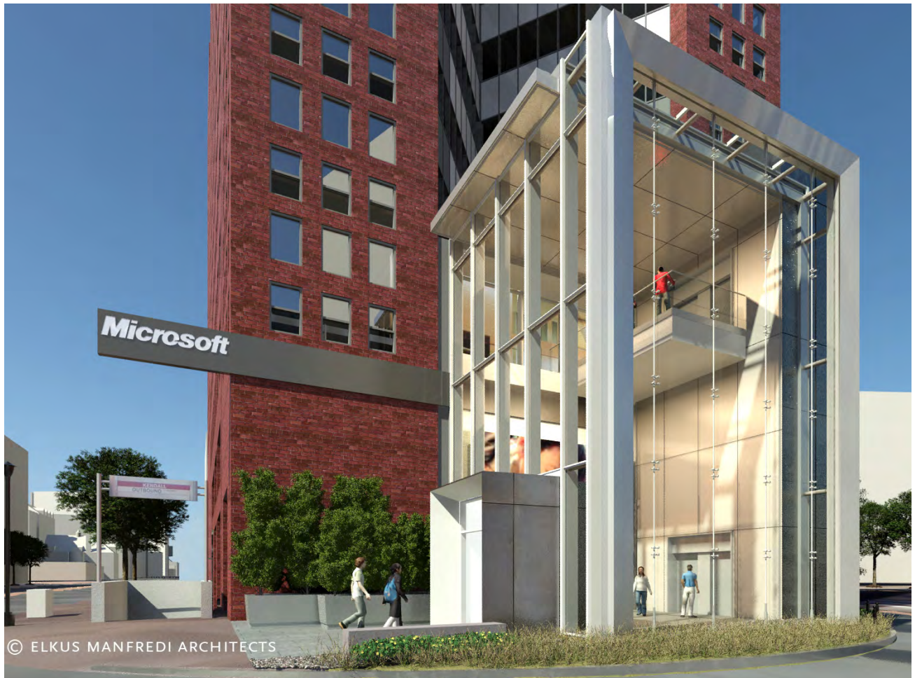
Microsoft Entryway - Main & Broadway (under construction)