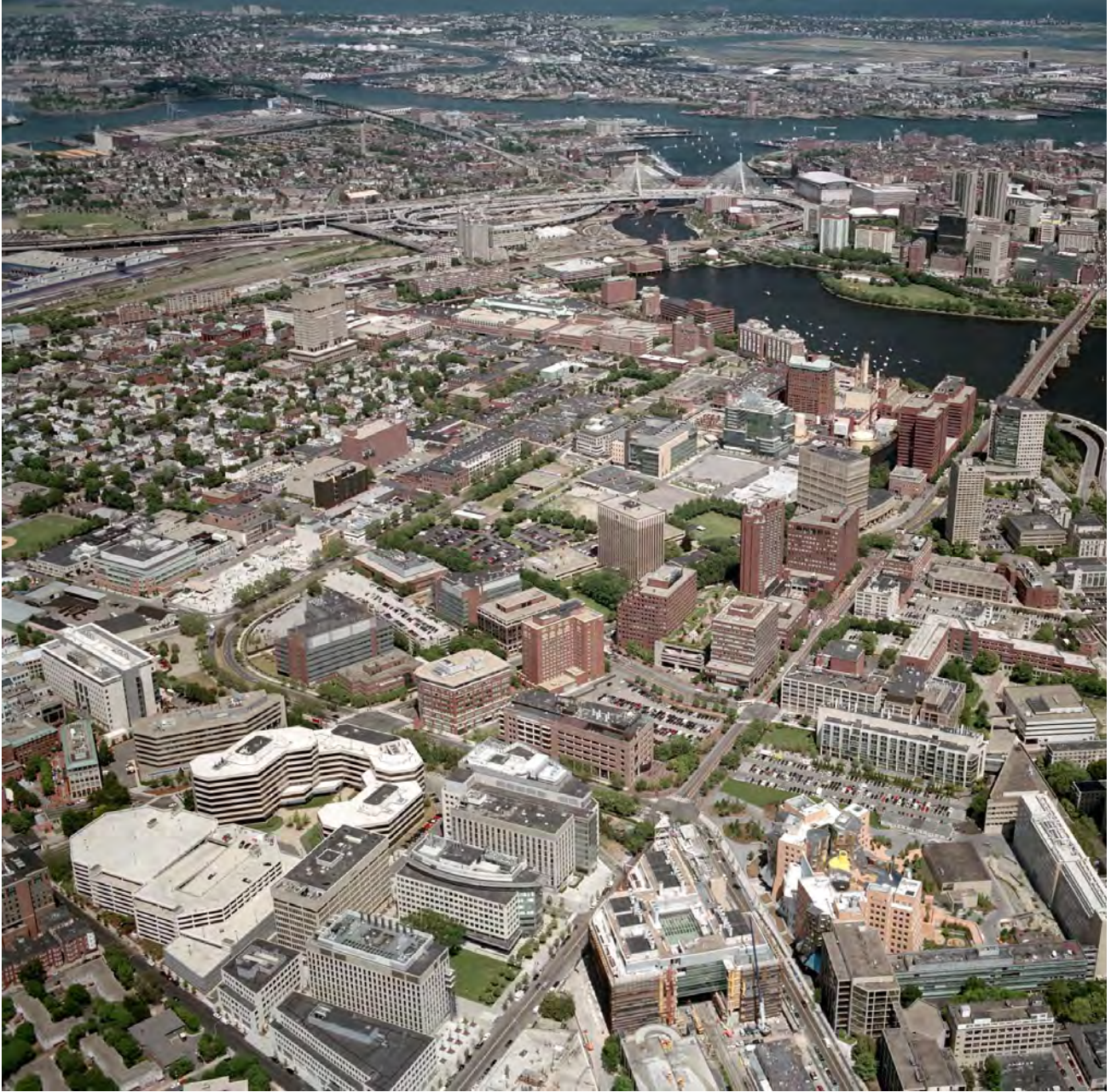
Kendall Square c.2000