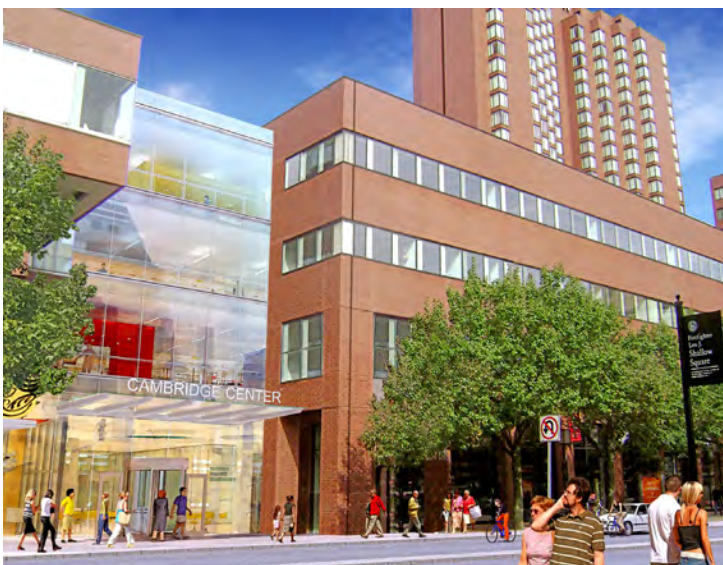
Google - New Entryway on Main