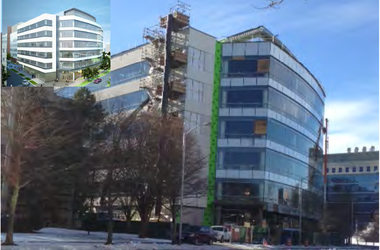
Biogen Expansion (under construction)