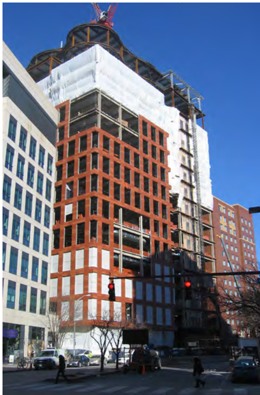
Broad Expansion (under construction)