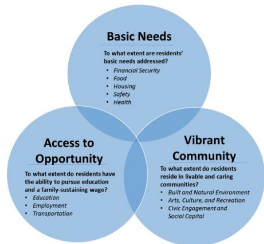
Cambridge Community Needs Framework

The Cambridge Redevelopment Authority (CRA) working with a Selection Committee consisting of City of Cambridge (the “City”) staff from various departments, conducted the final review and selection of proposed project for the 2019 Forward Fund (the “Fund”). The review was intended to provide the Selection Committee the opportunity to evaluate the proposals that had been submitted to the CRA by a diverse set of local nonprofit organizations. Throughout this year, nonprofits were asked to propose projects whose goals and objectives are aligned with the action plans detailed in the City’s Envision Cambridge and the Community Needs Assessment reports.