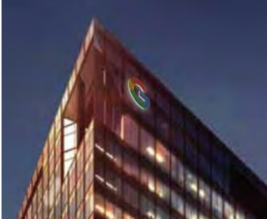
15' diameter G; recessed edge lit sign, note front face of sign is not illuminated