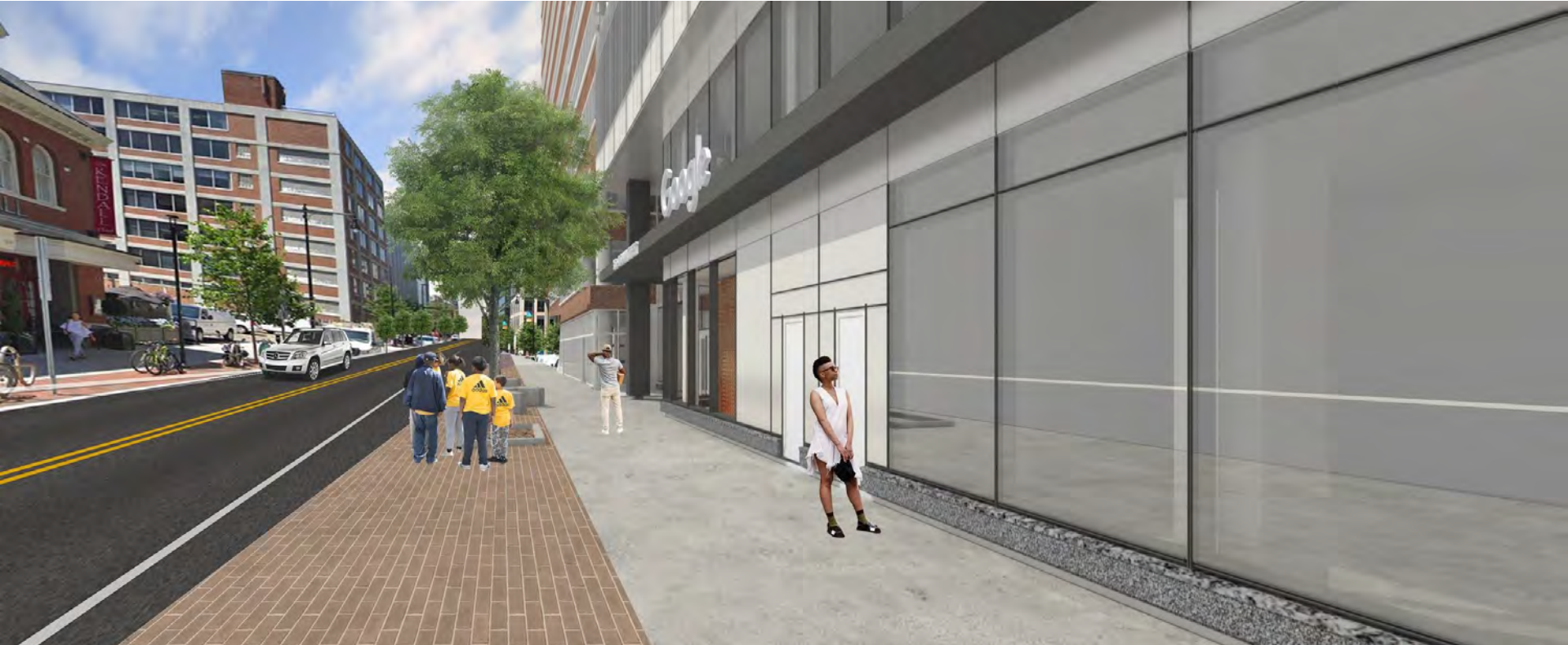
4'H x 16'L Google sign. Note sign is non-illuminated and the letters are 4" thick aluminum painted white.