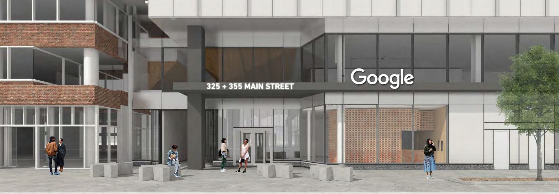
4'H x 16'L Google sign. Note sign is non-illuminated and the letters are 4" thick aluminum painted white.