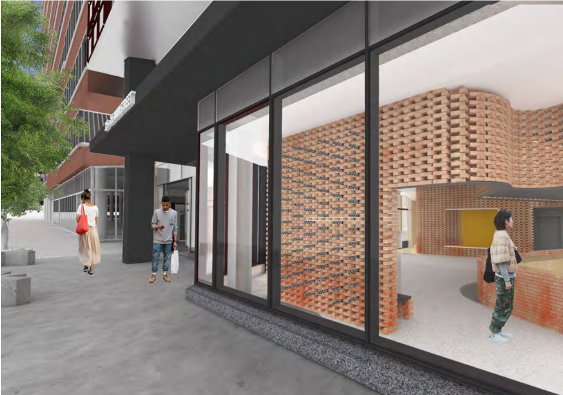
An independent display technology, LED ticklers, weaves through the gaps and along the faces of the wall, echoing the angles of the turning bricks.