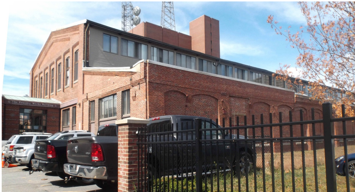
101 Rogers Street