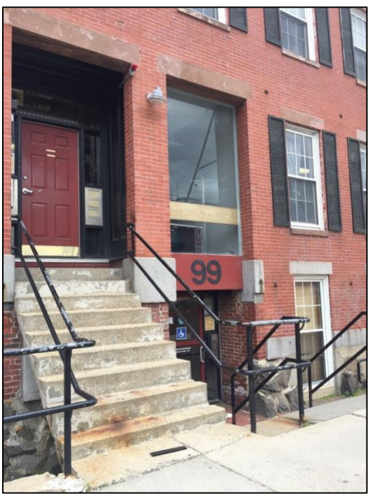
93-99 Bishop Allen Drive, 2019