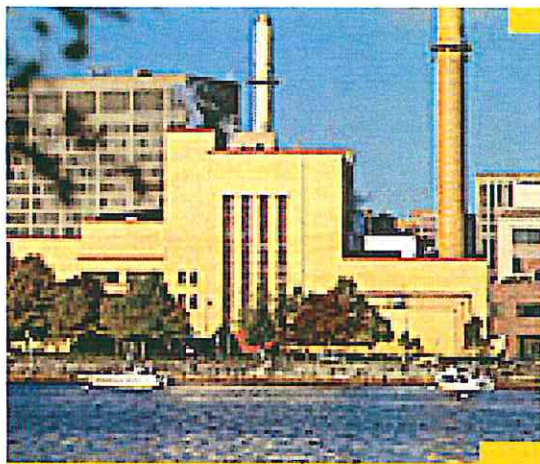
Kendall Generating Plant

support. At the July Authority meeting, the Executive Director reported on the status of negotiations permitting an electric power substation on the existing Mirant Kendall Station site. He reported that the location for the substation was preferred by all parties but Lyme Properties, an abutter to the location. In mid August, the Authority sent a letter to the Department of Environmental Protection (DEP) voicing its support for NSTAR's proposal to construct a new electric distribution substation on the northeast corner of the existing Mirant Kendall Station site. The letter identified the significant load growth in the Kendall Square area and in the entire eastern sector of Cambridge, as well as the need to separate distribution functions from Kendall Station as reasons the DEP should expedite any and all needed state approvals to allow the project to move forward quickly.