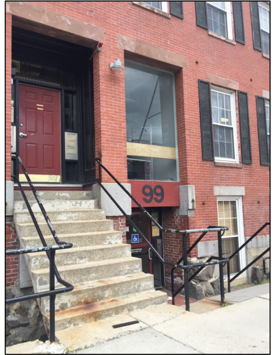
93-99 Bishop Allen Drive, 2019