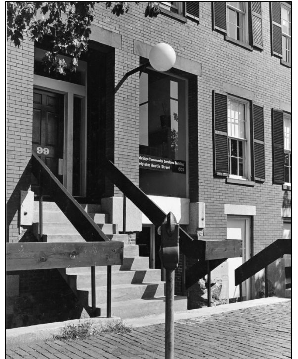
93-99 Bishop Allen Drive, circa 1970, after renovations