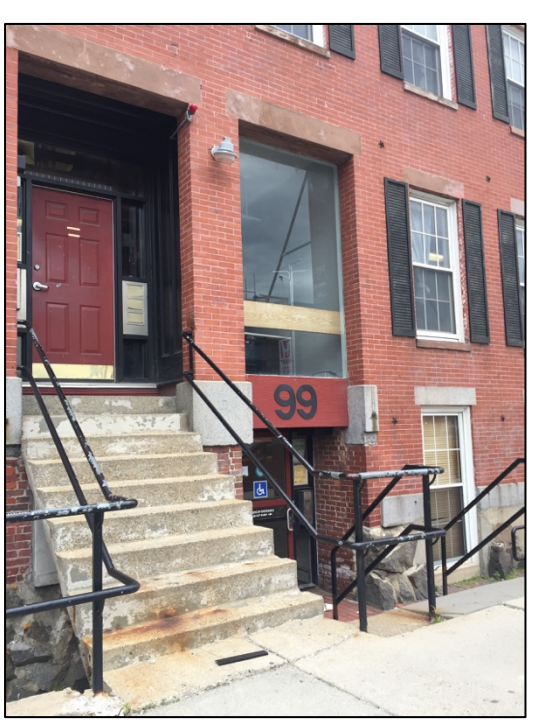
93-99 Bishop Allen Drive, 2019