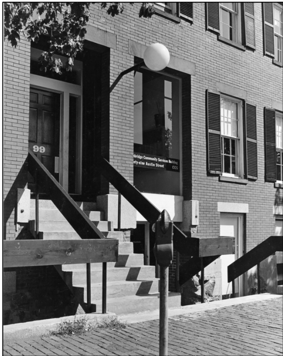
93-99 Bishop Allen Drive, circa 1965, after renovations