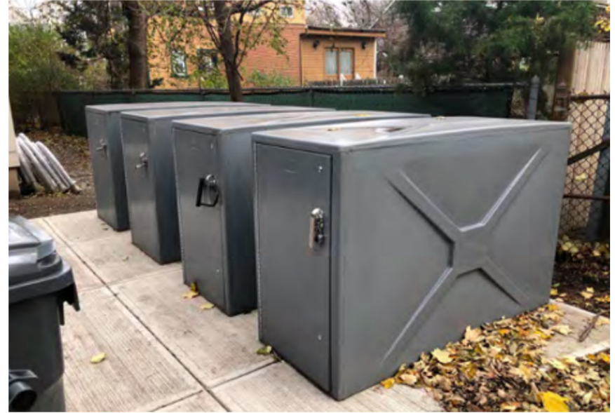
Bike Sheds at Linwood Court