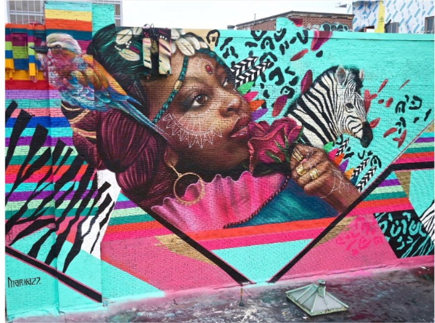
Central Square BID Murals - 2018 Forward Fund Awardee

The Fund provides financial assistance for capital infrastructure projects that will improve or maintain the quality, efficiency, and accessibility of organizations that provide services for the benefit of the City's residents, workers, and visitors. It provides grants for Capital Infrastructure projects and initial Feasibility Studies.