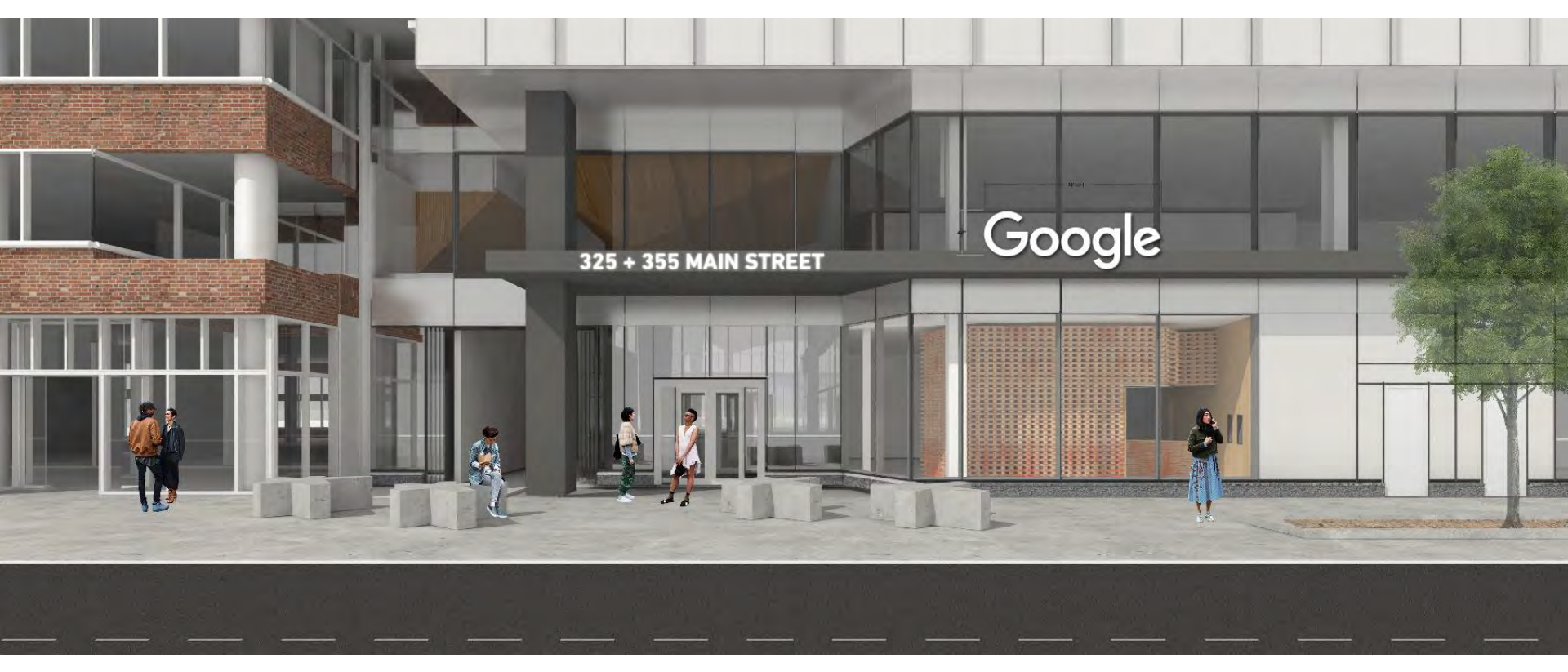
4'H x 16'L Google sign. Note sign is non-illuminated and the letters are 4" thick aluminum painted white.