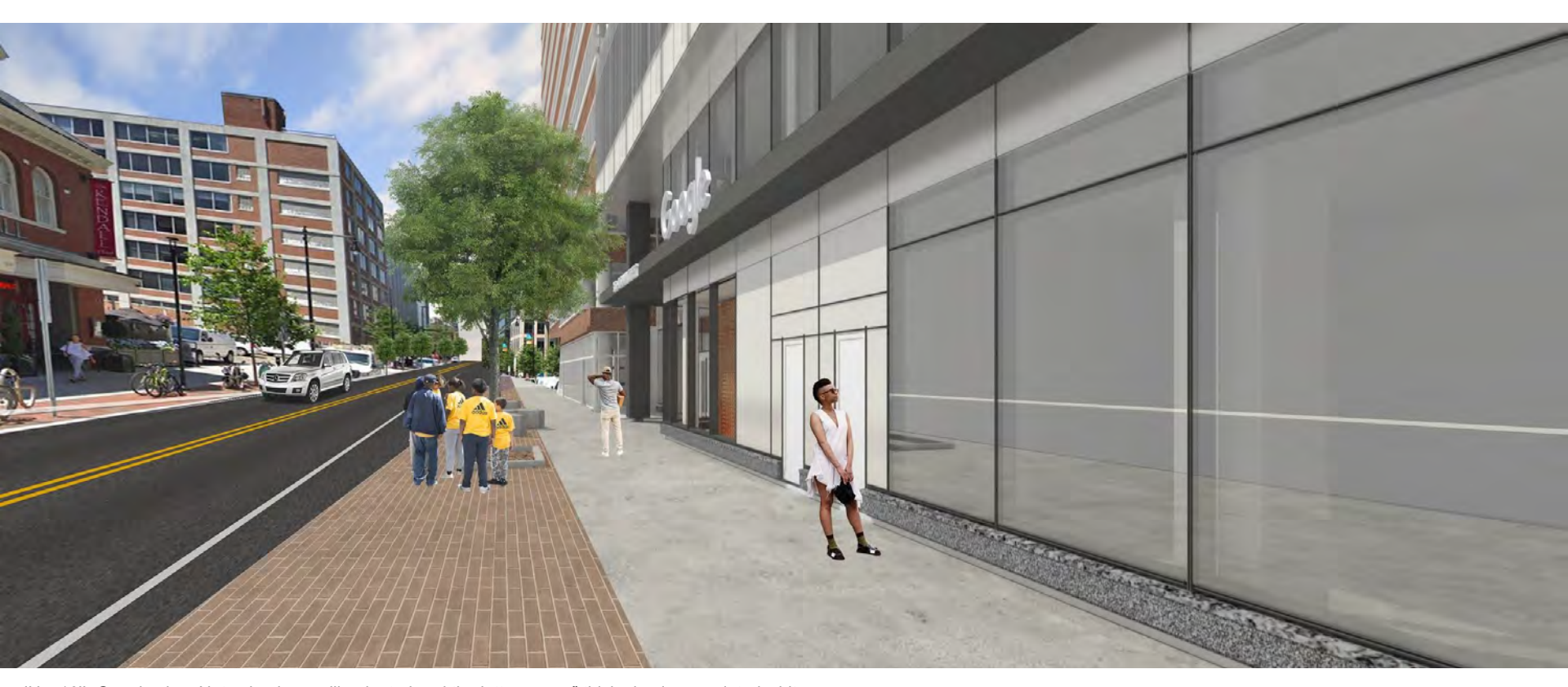
4'H x 16'L Google sign. Note sign is non-illuminated and the letters are 4" thick aluminum painted white.