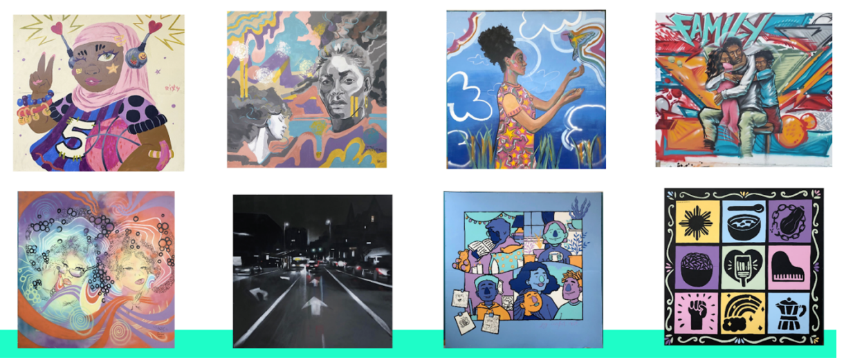
Murals from past Mural Masters events.

The CRA has partnered with the Community Art Center (CAC) on a new temporary art installation within Parcel 6 to debut this June. CAC hosts a Mural Masters event each year at their Port Arts Festival, bringing together local artists who partner with CAC's Teen Public Art Program on a live mural painting contest. Starting this year, the four murals produced during this event will be showcased at Parcel 6 for 12 months starting in June. The CRA is excited to reactivate the art program within Parcel 6 and showcase the talented work of local artists.