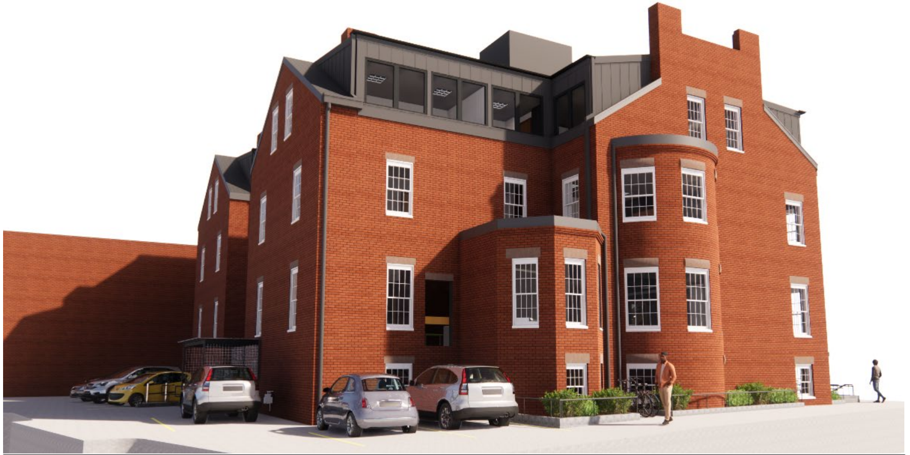
VIEW FROM ESSEX STREET