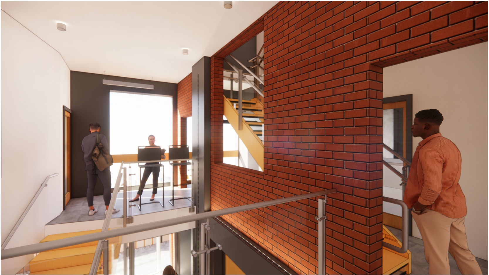
ATRIUM VIEW AT 99 BISHOP ALLEN DRIVE