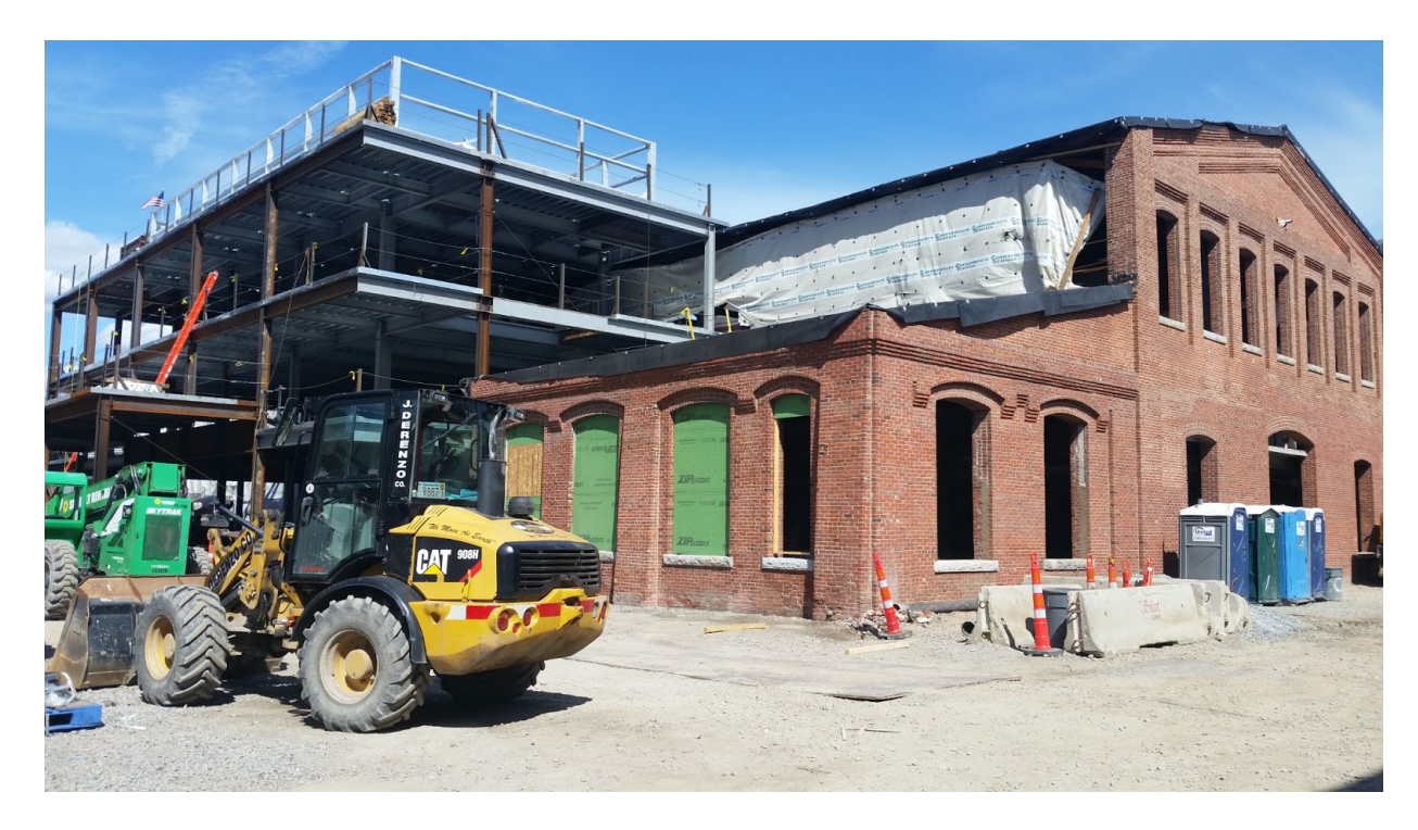
Foundry - Foundry construction remains on time to be substantially complete by May 31, 2022, with all punch list items completed by July 31, 2022.

Masonry work is 90% complete. Concrete slab on deck has started to be installed in the addition, starting with the third floor. Concrete slab on deck is completed for both the second and third floors in the historic building, and the third-floor ceiling has been refinished and completed.