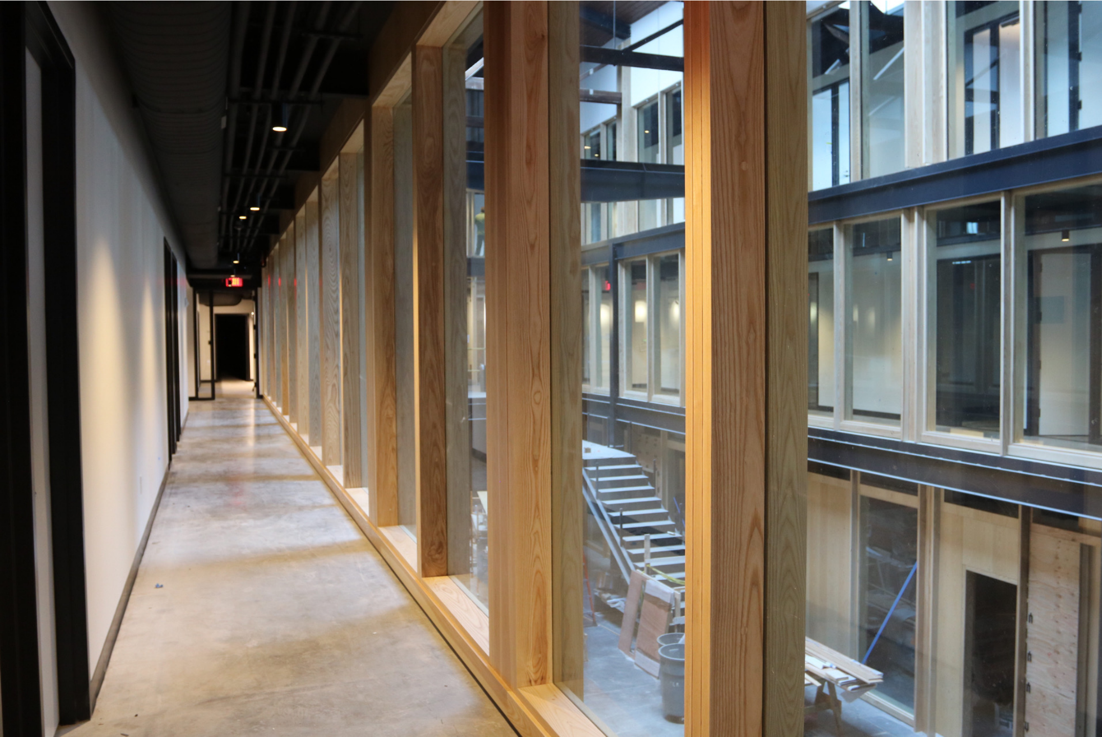
Second Floor Offices