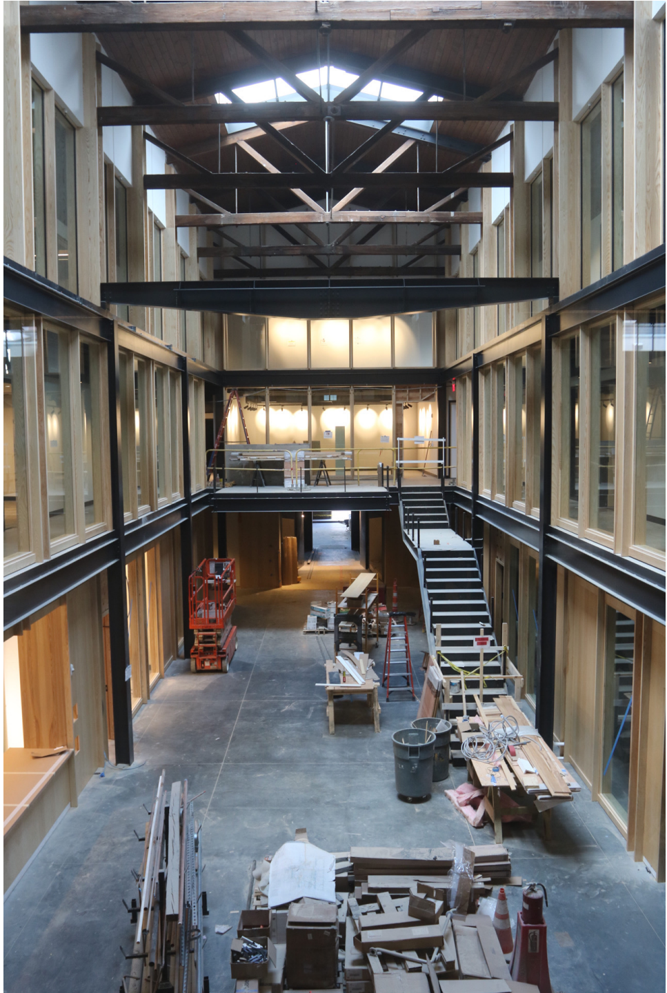
Community Hall from 2 nd Floor