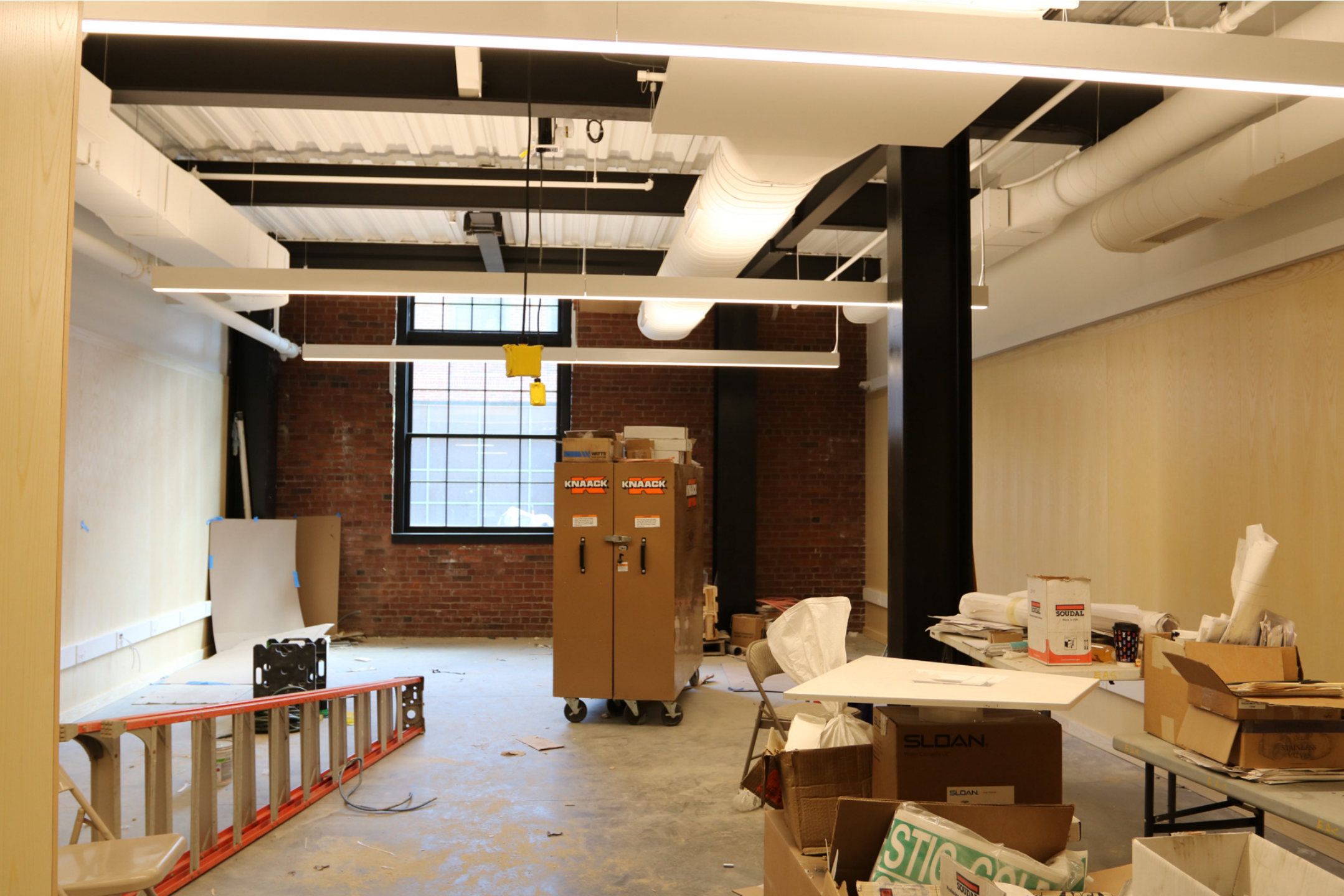
Fiber Arts Workshop