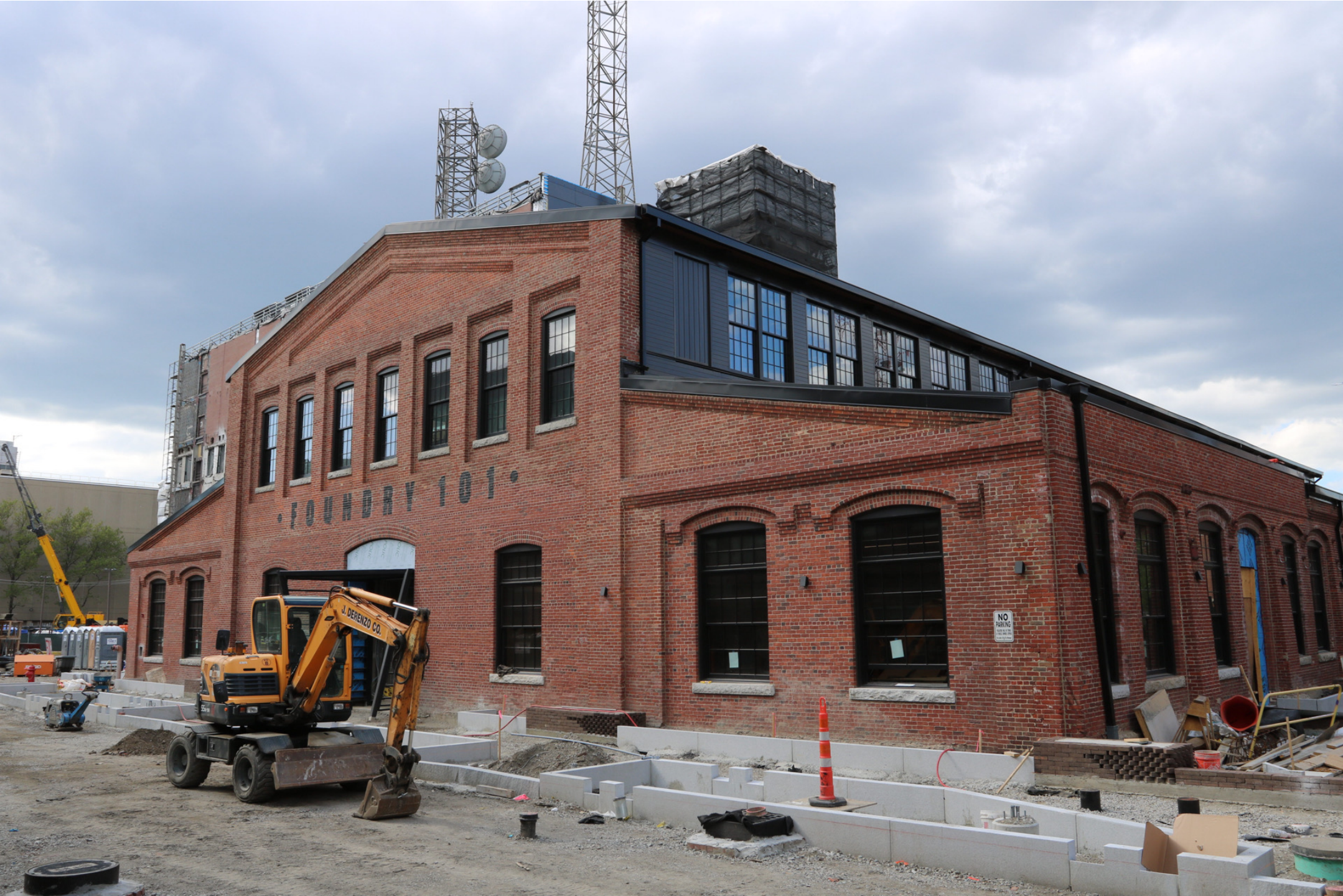
Rogers St Entry