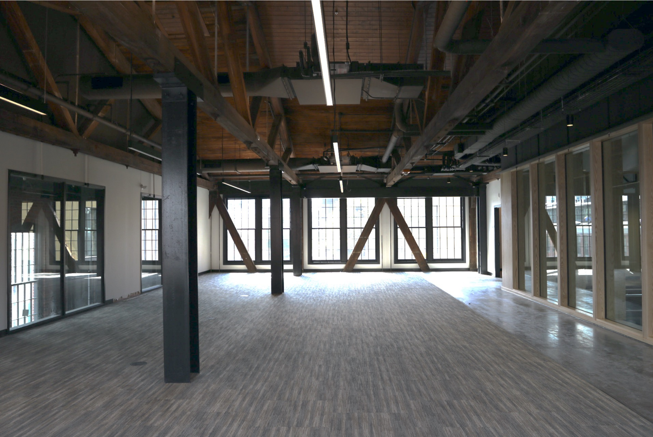
Third Floor Offices