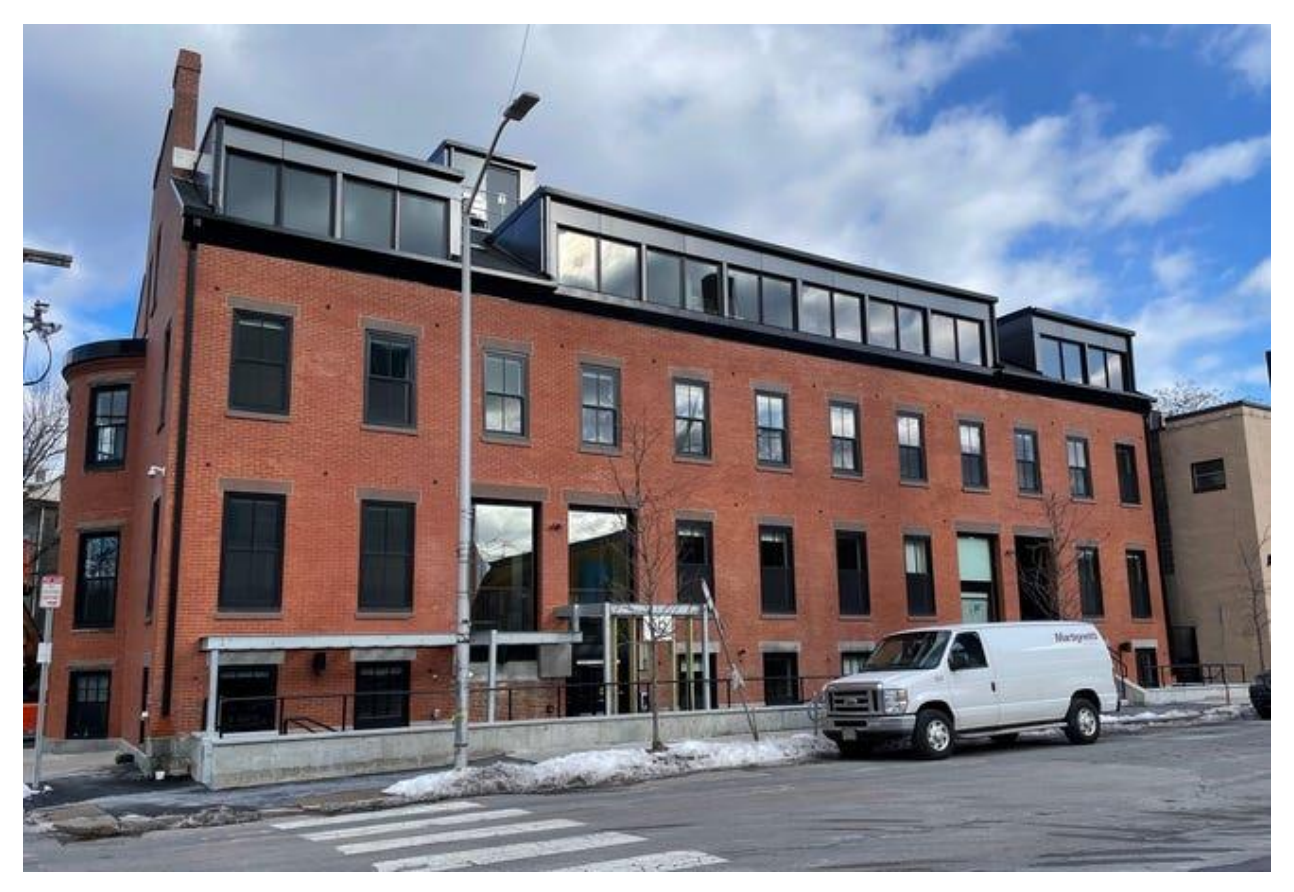
At the bequest of the building's nonprofit tenants, the CRA acquired the Central Square property for $8.8 million in the fall of 2019 and subsequent

"This is a real win for this neighborhood and our nonprofit tenants who are returning," said Schwarz. "The building is so beautiful, and it's just a very good moment for this project."