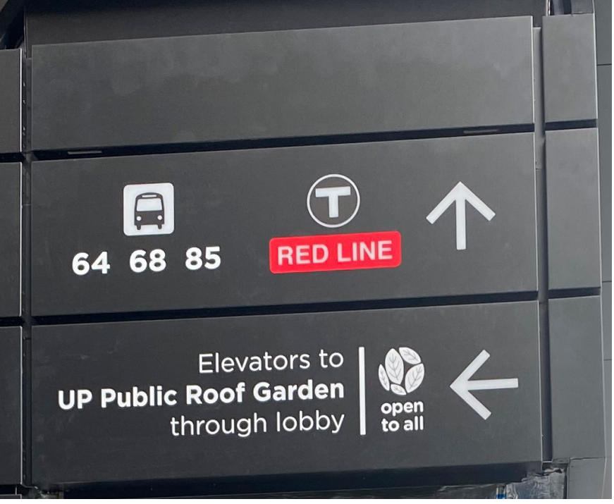
Privately Owned Public Spaces Signage Guidelines