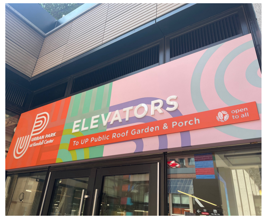
Privately Owned Public Spaces Signage Guidelines